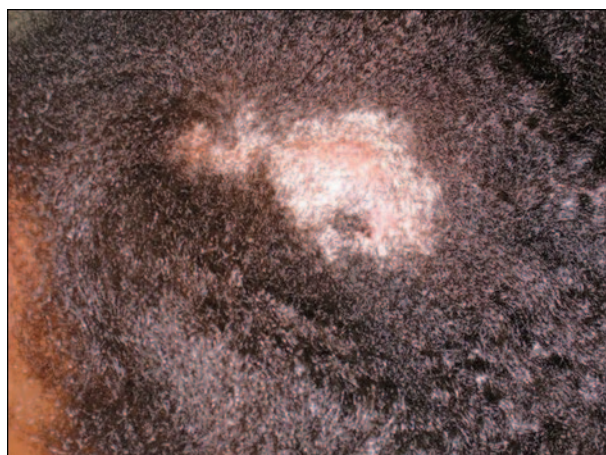
Figure 14. Kerion with boggy lesion, multiple pustules, and hair loss.

General practitioners and dermatologists may have slightly different approaches. Many dermatologists document all infections with cultures and repeat cultures monthly until they are negative because clinical improvement may be dramatic despite a persistently positive culture. In a general pediatric practice, cultures often are reserved for cases in which the diagnosis is unclear, the condition is unresponsive, the patient relapses, or there is