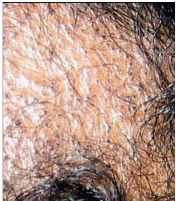
Figure 9. Tinea capitis, showing black dots from broken hairs in area of hair loss.