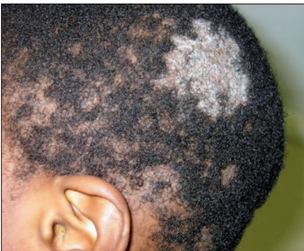
Figure 11. Tinea capitis that was resistant to high-dose griseofulvin after 6 weeks of treatment. Some of the smaller lesions are new. Culture grew T tonsurans .

Infection of hair or nails in tinea capitis, tinea barbae, and tinea unguium requires systemic treatment because topical antifungal medications do not penetrate into the