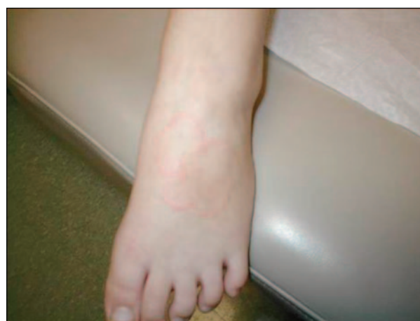
Figure 4. Granuloma annulare. Note the lack of scaling.

Impetigo, caused by bacterial infection, can form circular, crusted lesions that occasionally are confused