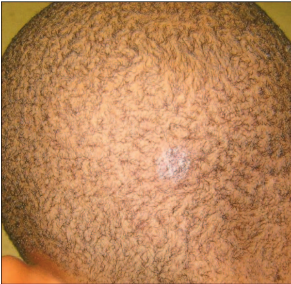
Figure 6. Tinea capitis characterized by gray, patchy scaling with alopecia. Lesion was noted after a haircut.