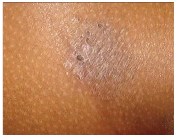
Figure 3. Nummular eczema, showing typical crusting without central clearing.

Other nondermatophytic fungi cause superficial infections. Candida infection has a more erythematous presentation and has an irregular shape and satellite lesions at the edge of an inflamed area. Tinea versicolor now is referred to commonly as Pityrosporum versicolor to differentiate it from dermatophyte infections because it is not a true tinea. It is caused by a filamentous form of Malassezia furfur ( P orbiculare is the yeast form). Multiple oval, hypo- or hyperpigmented, macular lesions that have very fine scales usually appear on the upper trunk, face, and proximal arms. The condition usually is asymptomatic, chronic, and more prominent when sun-exposed areas fail to tan. The rash can be pruritic, espe-