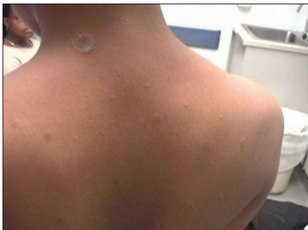
Figure 5. Herald patch of pityriasis rosea on neck.

with excoriated tinea lesions or may coexist with dermatophytes.