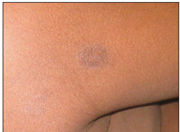
Figure 2. Tinea corporis, with raised papular border, some scaling, and central clearing.

Tinea corporis often appears initially as a red, scaly papule spreading outward, with a coalescence of papules into plaques that become scaly (Fig. 1). The lesion becomes an annular, pruritic plaque on glabrous (smooth and