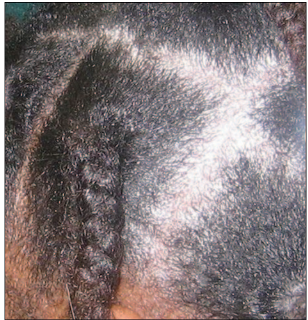
Figure 8. Tinea capitis characterized by thick white crusting of scalp. Note hair loss with widening of hair part and compare with normal hair part in front of the braid.