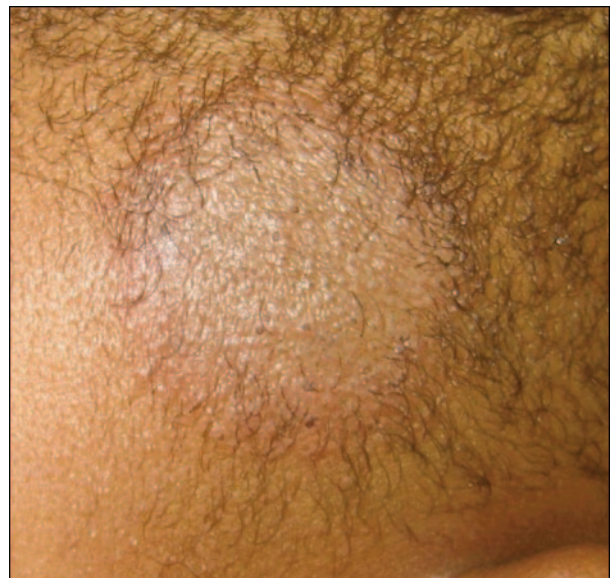
Figure 13. Kerion with boggy early lesion and multiple broken hairs. Few small pustules are forming.