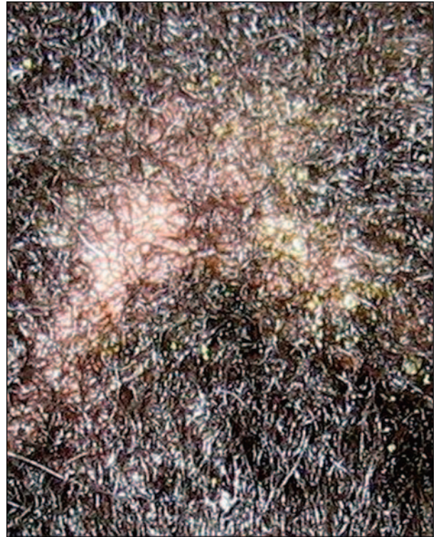
Figure 12. Tinea capitis, showing both white scales and yellow, purulent exudates with hair loss that was very pruritic. Child had been scratching her head constantly during a routine physical examination. Culture grew T tonsurans .