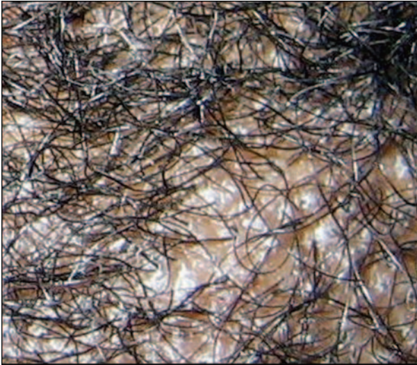
Figure 10. Tinea capitis in close up, showing white crusting around hair root and some broken hairs.

burn at the site with undiluted bleach, should be discouraged because they can cause infection and scarring. Topical therapy should be applied at least 2 cm beyond the edge of the lesions once or twice daily for 2 weeks, depending on the agent. If the lesion persists after 4 weeks of topical therapy, it is considered a treatment failure. Extensive, severe, or resistant cases of tinea corporis may require systemic treatment (Table 5).