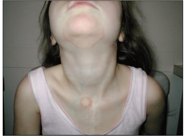
Figure 1. Tinea corporis on body and tinea facie. Note the erythematous border and scaling.

The diagnosis can be made from history, clinical presentation, culture, and direct microscopic observation of hyphae in infected tissue and hairs after potassium hydroxide preparation. Culture is useful in tinea capitis and tinea unguium and in treatment failures at other sites. Organisms can be collected by scraping or brushing with a toothbrush or damp cotton swab at the leading edge of the infection and placing the material on a dermatophyte medium. Most dermatophytic media contain Sabouraud dextrose agar; chloramphenicol is added to inhibit bacterial growth and cycloheximide to inhibit saprophytic fungi. Adding phenol red changes the agar color in the presence of alkaline dermatophyte metabolites and iden-